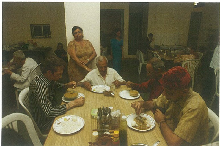
Residents enjoying their meal

This munificent support enables us to provide the best possible services to our residents.