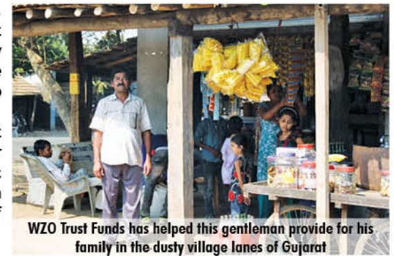
WZO Trust Funds has helped this gentleman provide for his family in the dusty village lanes of Gujarat

“Kind words can be short and easy to speak, but their echoes are truly endless.” & “Love is a fruit that is in season at all times, and within reach of every hand.”